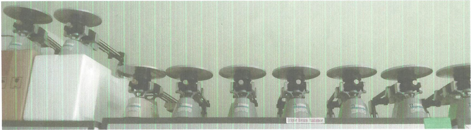
TRIPLE BEAM BALANCE